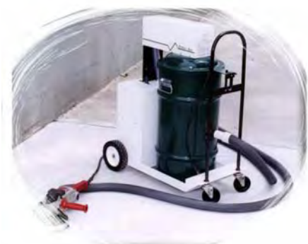
All hand grinders attach to the A-101 Pulse Vac with a 1.5" hose.