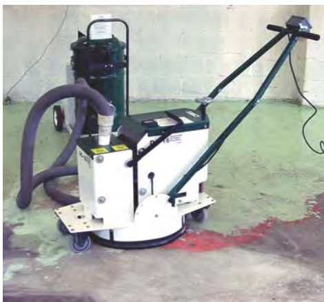
Great for coating removal!