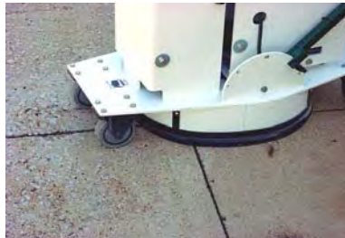
Excellent for grinding uneven seams!