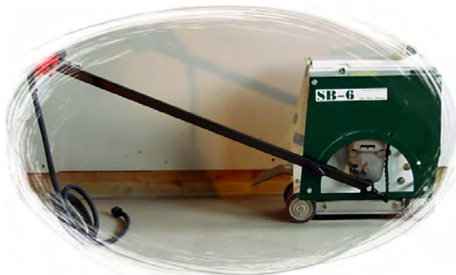
Fully adjustable handle for hard to reach places.