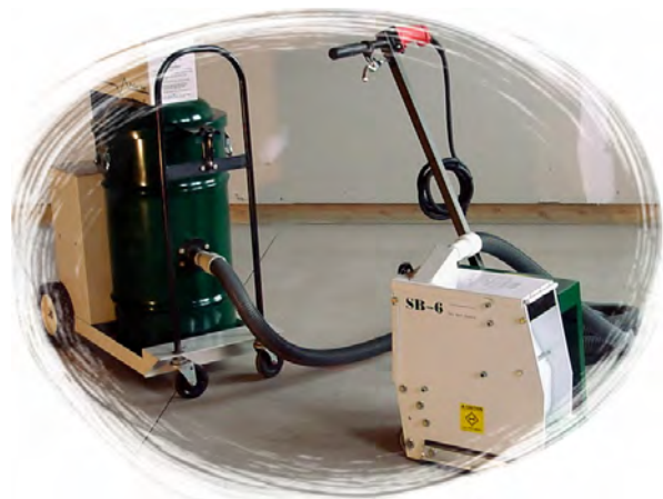
Attached to the A-101 Pulse Vac with 1.5" hose