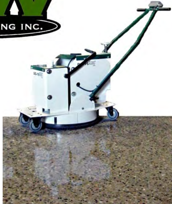
Completely Dry Polishing!

The response we have been receiving from our customers with the DG-16 is "Total amazement". The production is two to three times faster and has a more consistent profile than any other diamond grinder they have used.