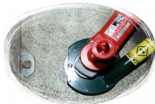
Removable guard exposes cup edge. (only on 4.5" models)